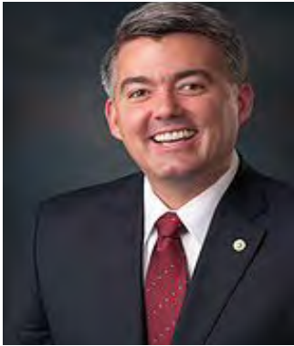
Senator Cory Gardner (CO)

Celebrating U.S. Science & Engineering Champions!