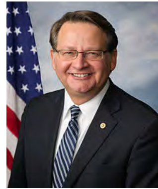
Senator Gary Peters (MI)

Please Join us at a Special Reception & Exhibit as The Science-Engineering-Technology Working Group Proudly Presents Its